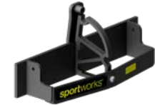
NARROW PROFILE PIVOT PLATE