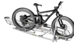
FAT TIRE TRAYS