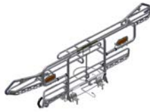
TURN SIGNAL KIT

INTEGRATED BIKE RACK POSITION COUNTING FOR YOUR APC N/A N/A N/A APEX 2, APEX 3, DL2, DL2 NP, TRILOGY AVAILABLE FOR OEM OR AFTER MARKET INSTALLATION