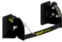
APEX PIVOT PLATE