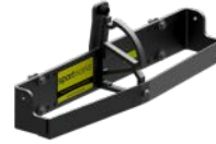
STANDARD PIVOT PLATE