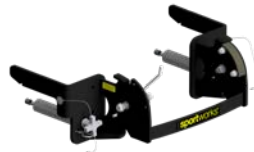
TEN SECOND BRACKET