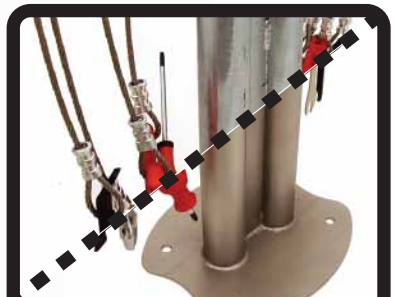
Finishes: Powder coating, galvanized, or stainless steel