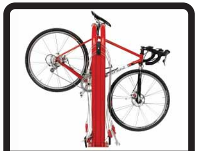
Universal bike mounting - hang by seat or top tube